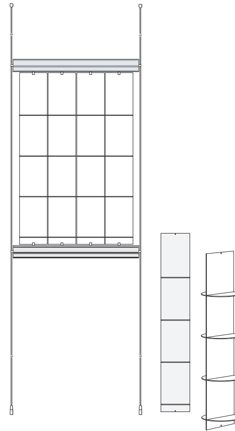
Product Panels - A highly attractive medium to display small items such as gifts, electrical accessories, jewelry, optical accessories etc. Creates a focal point in a large window. The small curved shelves are positioned on both sides of sandblasted acrylic panels, giving two displays in one area.