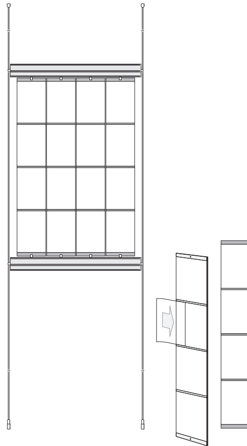
Pocket Blades - Individual acrylic pockets to take standard A4 (8.5"X11") paper. Standard units take 4 X A4 wide, with an option of 3 or 4 pockets high. All are double sided.